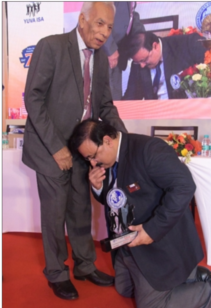
Felicitation Ceremony 2 nd National YUVA ISACON 2022, Haryana (14-15 October 2022)