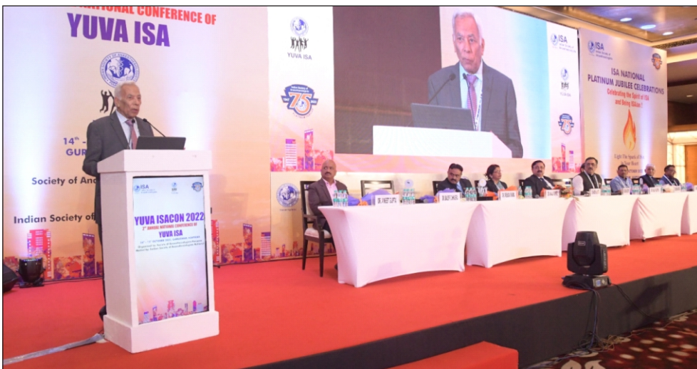
2 nd National YUVA ISACON 2022, Haryana (14-15 October 2022)