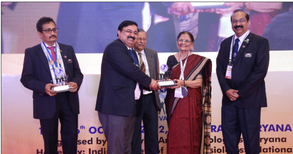
1 st Annual National YUVA Oration 2 nd National YUVA ISACON 2022, Haryana (14-15 October 2022)