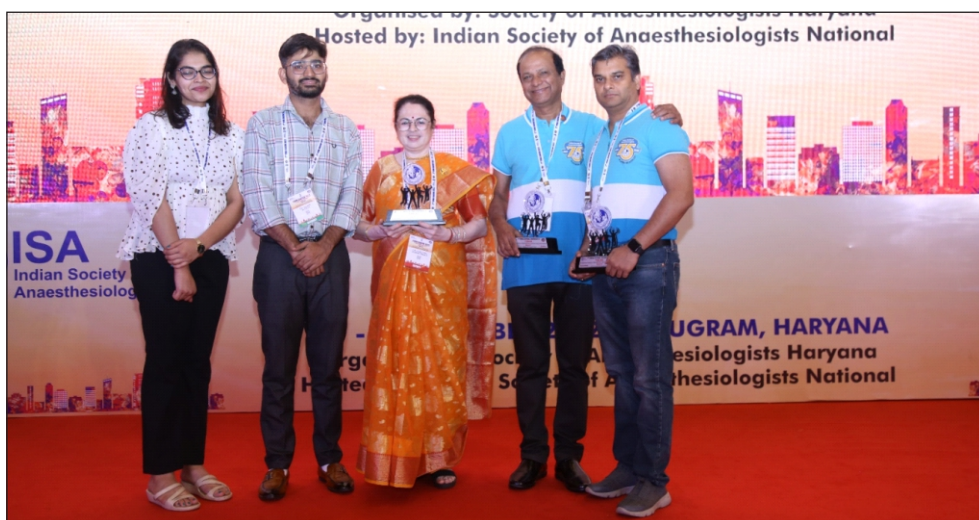
ISA Madhya Pradesh & Assam State Branch Scientific Session 2 nd National YUVA ISACON 2022, Haryana (14-15 October 2022)