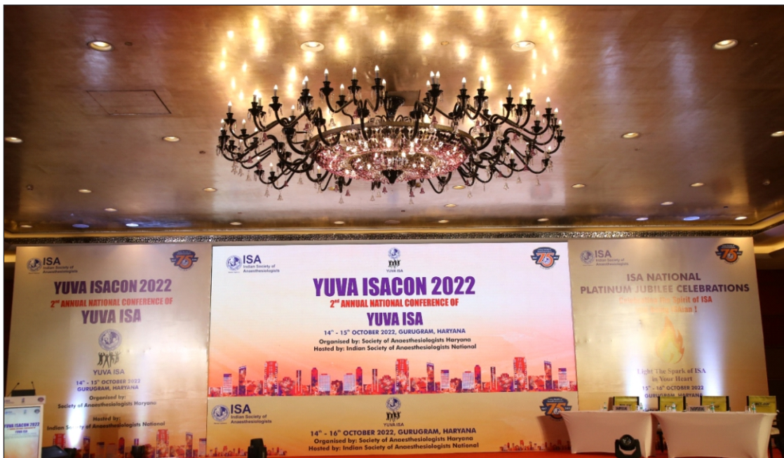
2 nd National YUVA ISACON 2022, Haryana (14-15 October 2022)