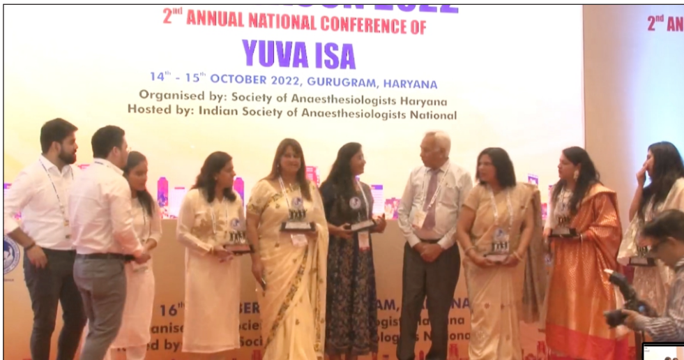
ISA Uttarakhand State Branch Scientific Session 2 nd National YUVA ISACON 2022, Haryana (14-15 October 2022)