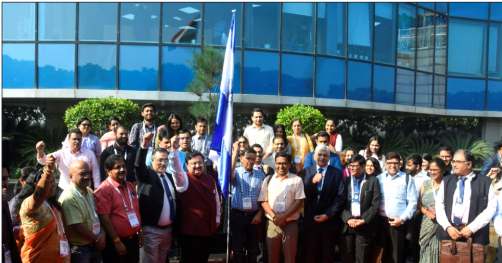
ISA Flag Hoisting during 2 nd National YUVA ISACON 2022, Haryana (14-15 October 2022)