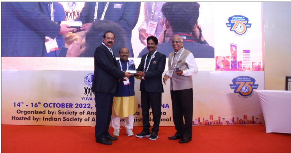
ISA Telangana State Branch Scientific Session 2 nd National YUVA ISACON 2022, Haryana (14-15 October 2022)