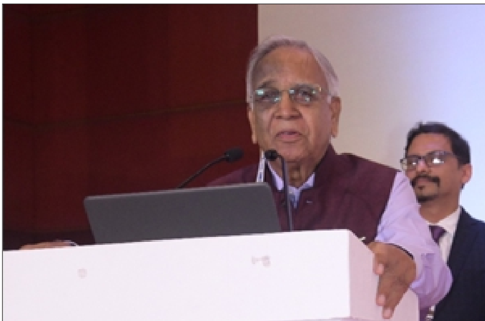
Felicitations of ISA National Past Presidents during 2 nd National YUVA ISACON 2022, Haryana (14-15 October 2022)