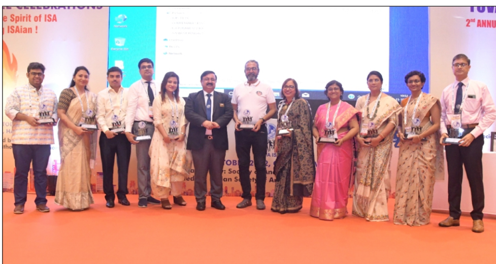
ISA West Bengal State Branch Scientific Session 2 nd National YUVA ISACON 2022, Haryana (14-15 October 2022)