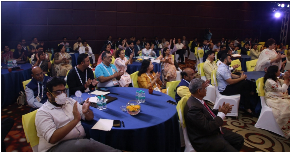
1 st Annual National YUVA Oration 2 nd National YUVA ISACON 2022, Haryana (14-15 October 2022)