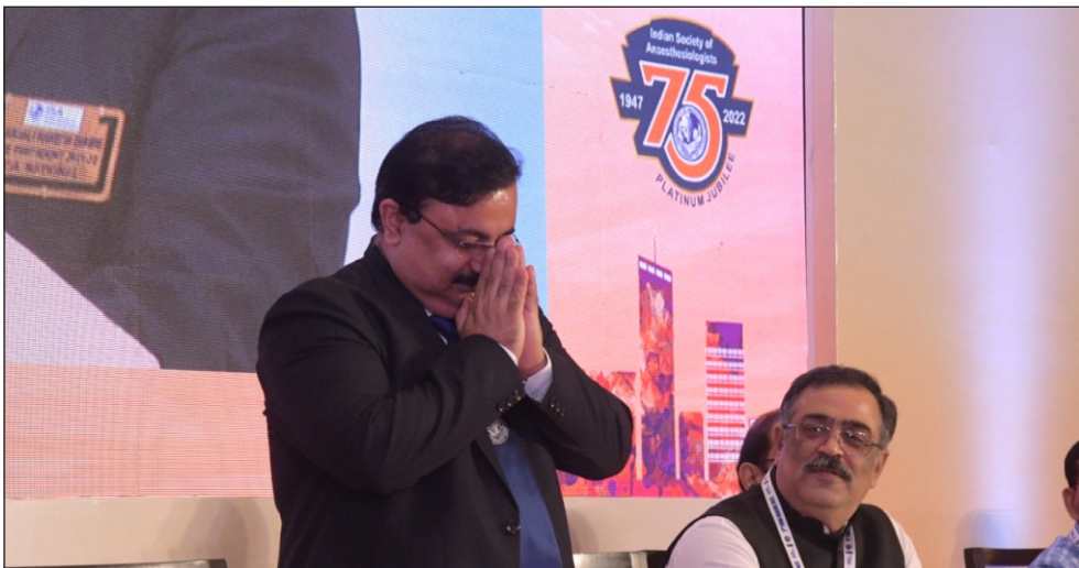
2 nd National YUVA ISACON 2022, Haryana (14-15 October 2022)