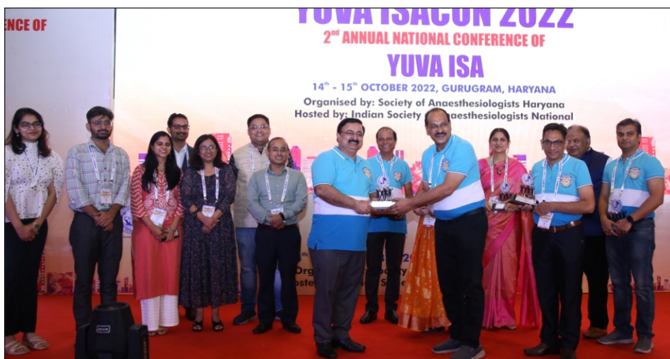
ISA Chhattisgarh State Branch Scientific Session 2 nd National YUVA ISACON 2022, Haryana (14-15 October 2022)