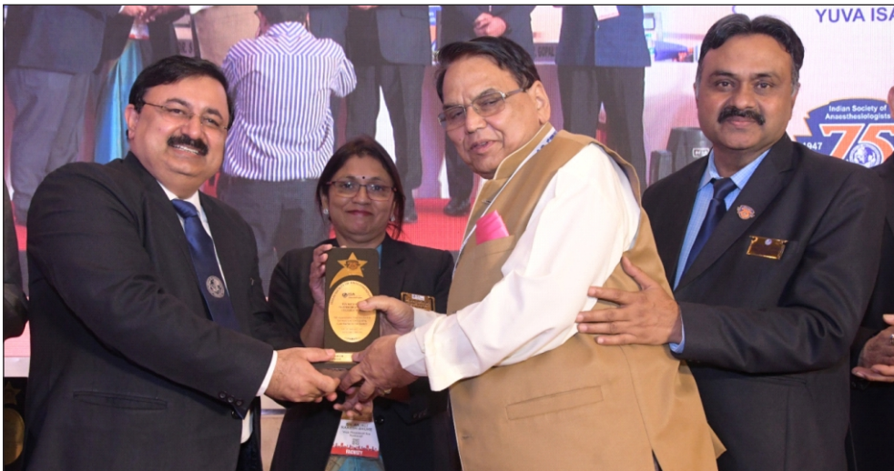
Felicitations Ceremony 2 nd National YUVA ISACON 2022, Haryana (14-15 October 2022)