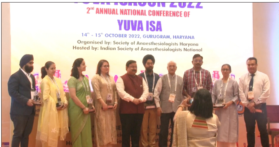
ISA Punjab State Branch Scientific Session 2 nd National YUVA ISACON 2022, Haryana (14-15 October 2022)