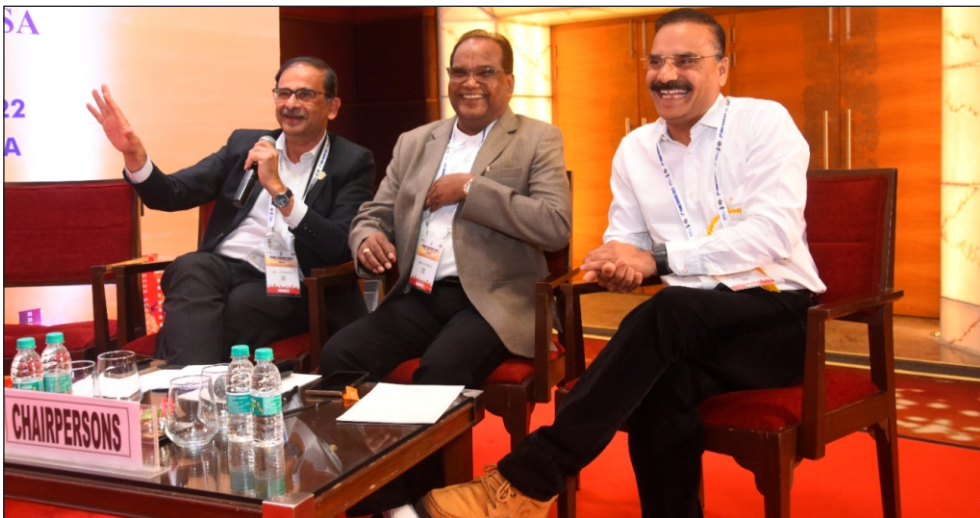
ISA Maharashtra State Branch Scientific Session 2 nd National YUVA ISACON 2022, Haryana (14-15 October 2022)