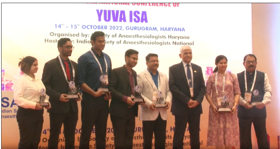
ISA Bihar State Branch Scientific Session 2 nd National YUVA ISACON 2022, Haryana (14-15 October 2022)