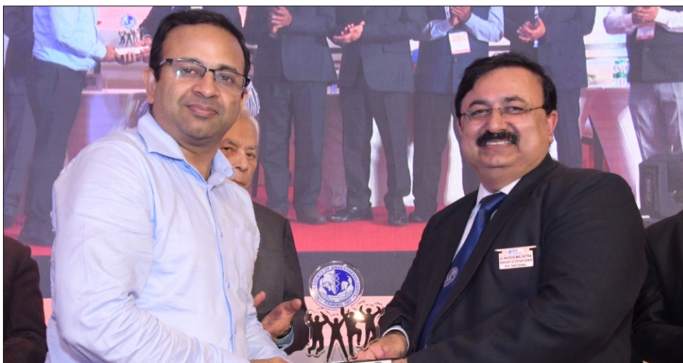
Felicitation of Organizing Committee 2 nd National YUVA ISACON 2022, Haryana (14-15 October 2022)