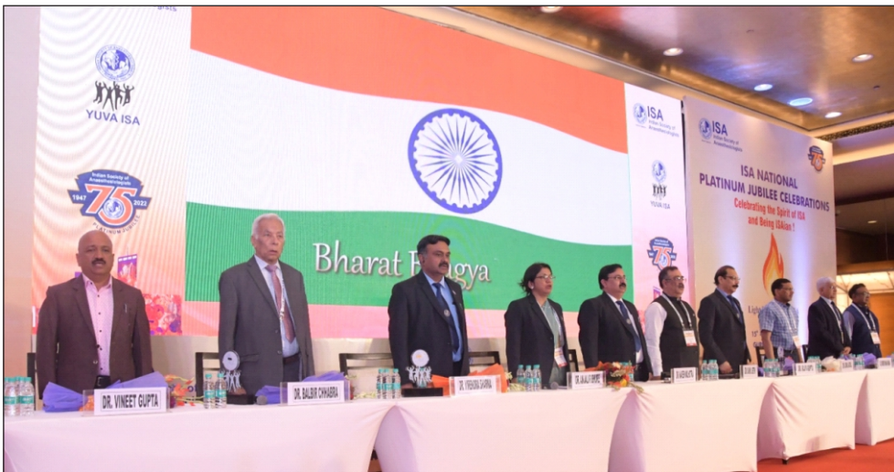
2 nd National YUVA ISACON 2022, Haryana (14-15 October 2022)