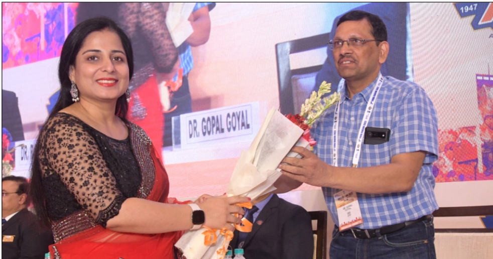
Inaugural Ceremony 2 nd National YUVA ISACON 2022, Haryana (14-15 October 2022)