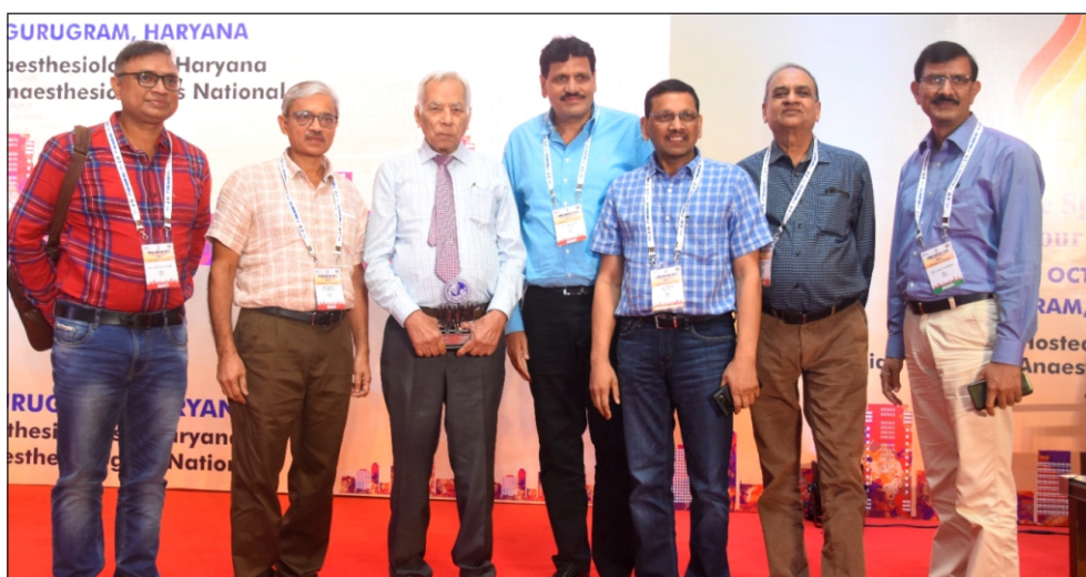
ISA Haryana State Branch Scientific Session 2 nd National YUVA ISACON 2022, Haryana (14-15 October 2022)