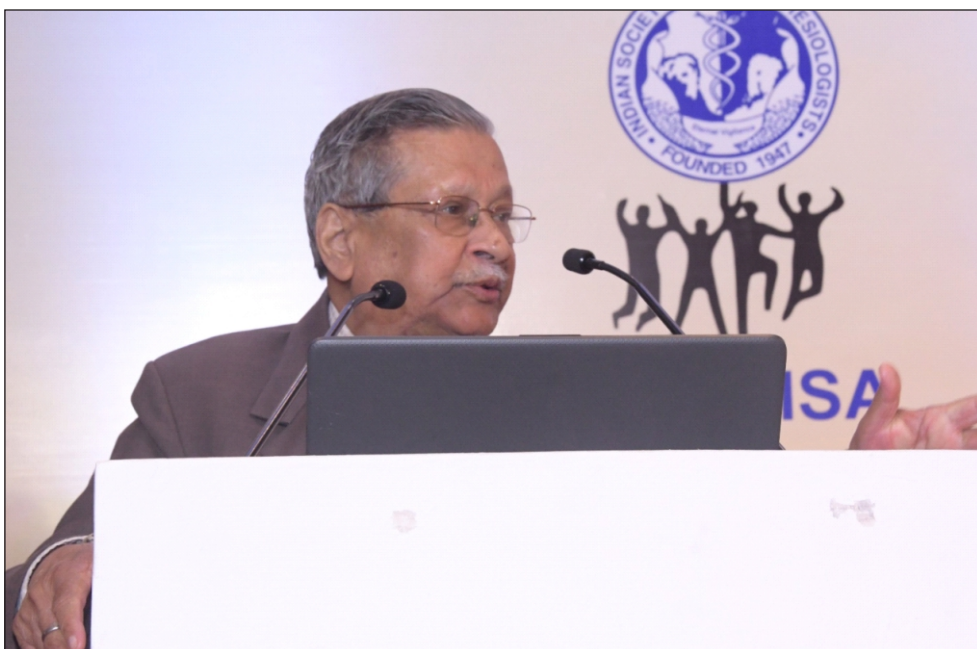
Felicitations of ISA National Past Presidents during 2 nd National YUVA ISACON 2022, Haryana (14-15 October 2022)