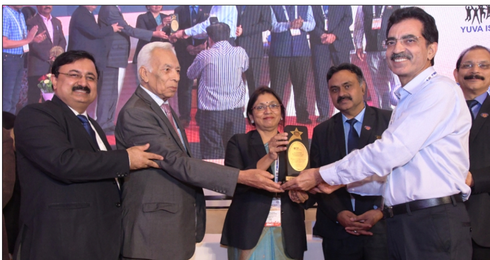
Felicitations Ceremony 2 nd National YUVA ISACON 2022, Haryana (14-15 October 2022)