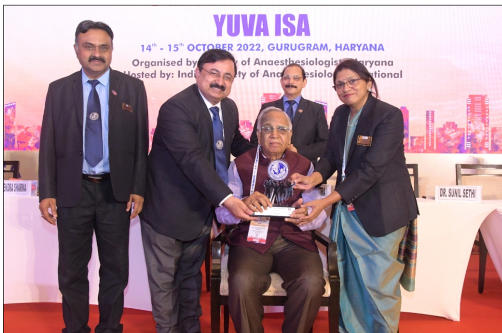
Felicitaton of ISA National Past Presidents during 2 nd National YUVA ISACON 2022, Haryana (14-15 October 2022)