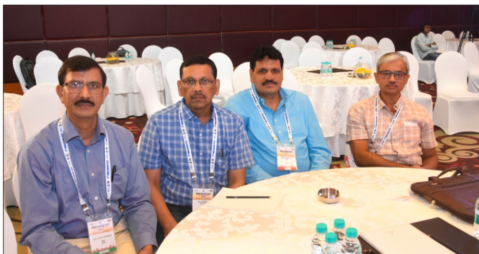
ISA Haryana State Branch Scientific Session 2 nd National YUVA ISACON 2022, Haryana (14-15 October 2022)