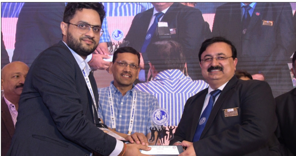
Felicitations of Organizing Committee 2 nd National YUVA ISACON 2022, Haryana (14-15 October 2022)