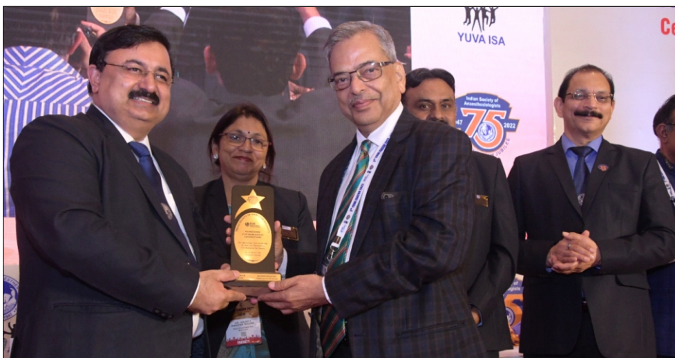
Felicitations Ceremony 2 nd National YUVA ISACON 2022, Haryana (14-15 October 2022)