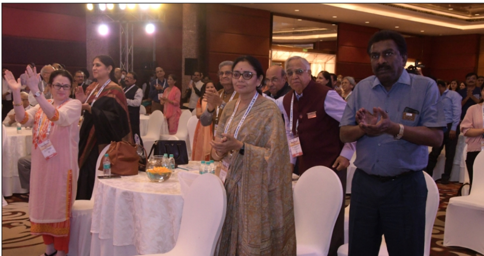
Inaugural Ceremony 2 nd National YUVA ISACON 2022, Haryana (14-15 October 2022)