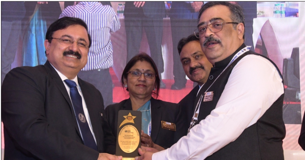
Felicitations Ceremony 2 nd National YUVA ISACON 2022, Haryana (14-15 October 2022)