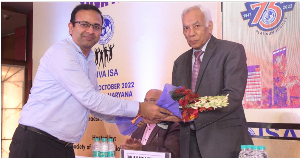
Inaugural Ceremony 2 nd National YUVA ISACON 2022, Haryana (14-15 October 2022)