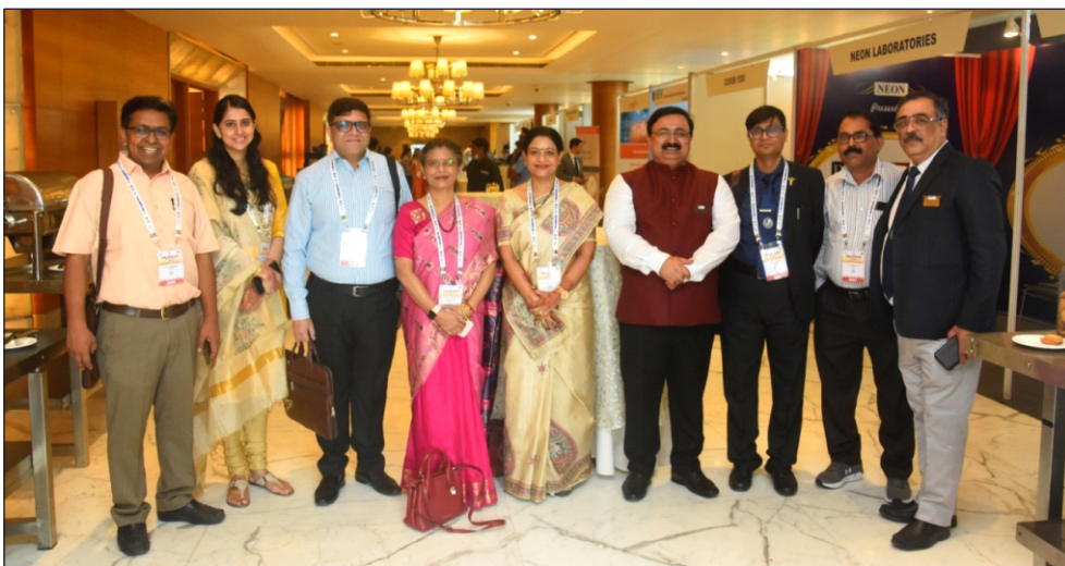
2 nd National YUVA ISACON 2022, Haryana (14-15 October 2022)