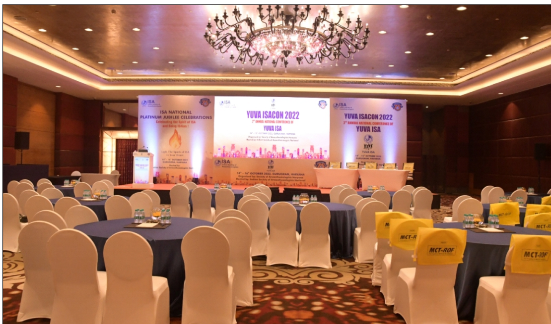
2 nd National YUVA ISACON 2022, Haryana (14-15 October 2022)