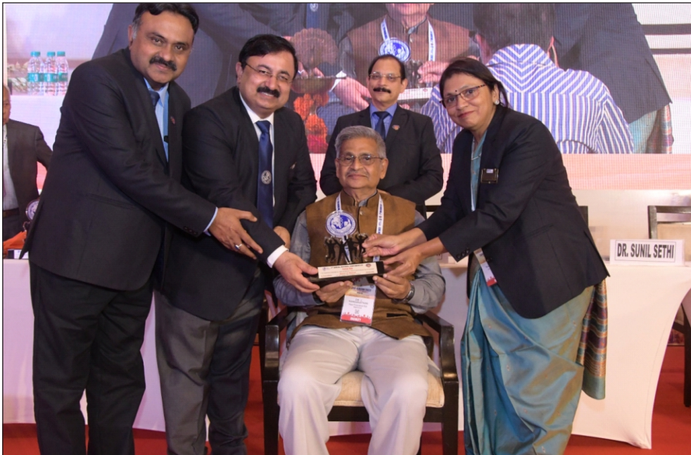
Felicitation of ISA National Past Presidents during 2 nd National YUVA ISACON 2022, Haryana (14-15 October 2022)