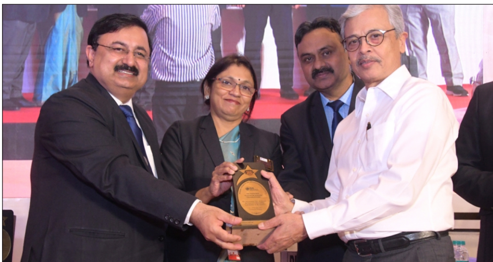
Felicitation Ceremony 2 nd National YUVA ISACON 2022, Haryana (14-15 October 2022)