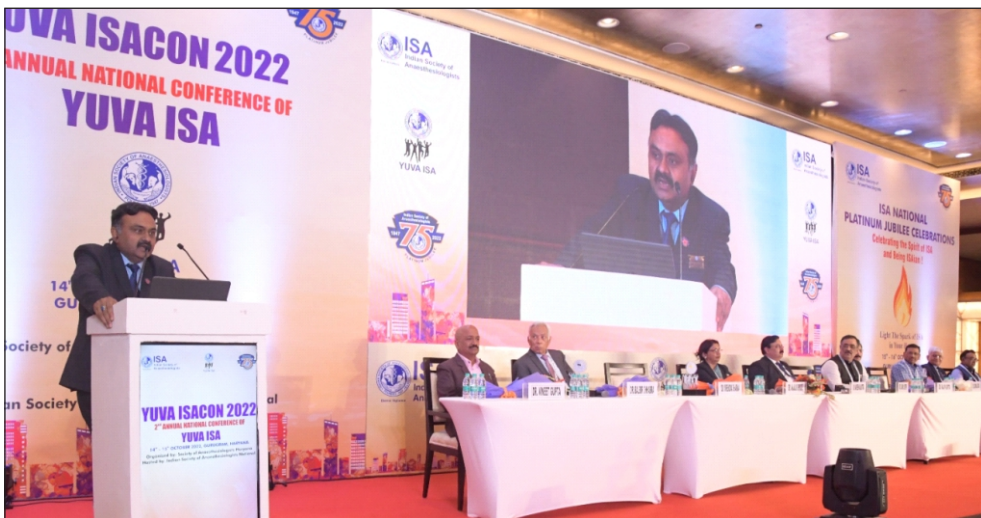
2 nd National YUVA ISACON 2022, Haryana (14-15 October 2022)