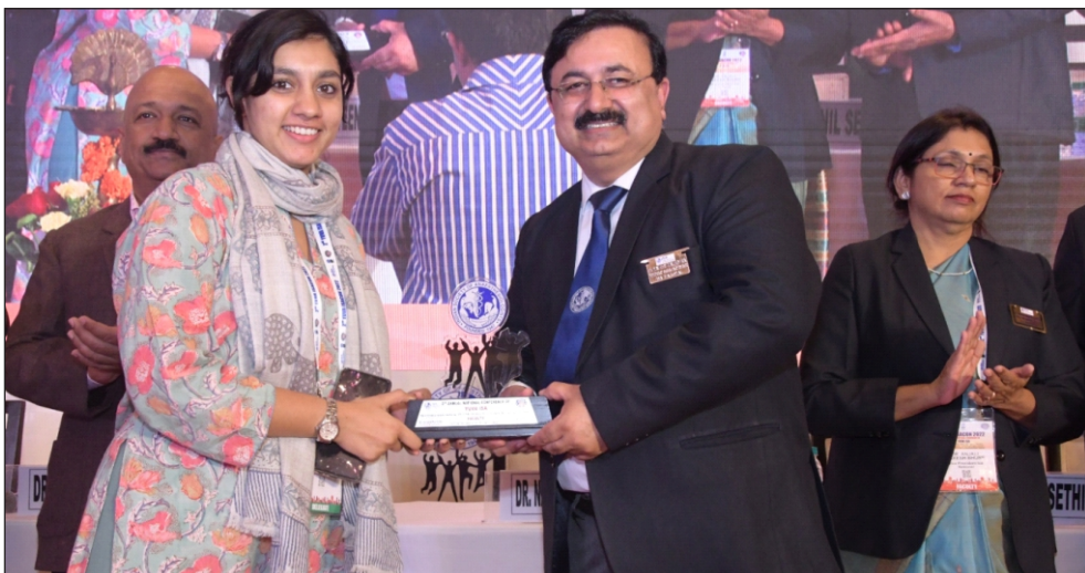
Felicitation of Organizing Committee 2 nd National YUVA ISACON 2022, Haryana (14-15 October 2022)