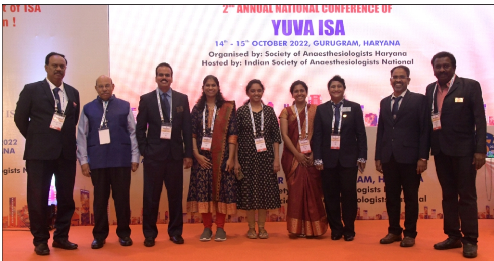
ISA Tamil Nadu State Branch Scientific Session 2 nd National YUVA ISACON 2022, Haryana (14-15 October 2022)