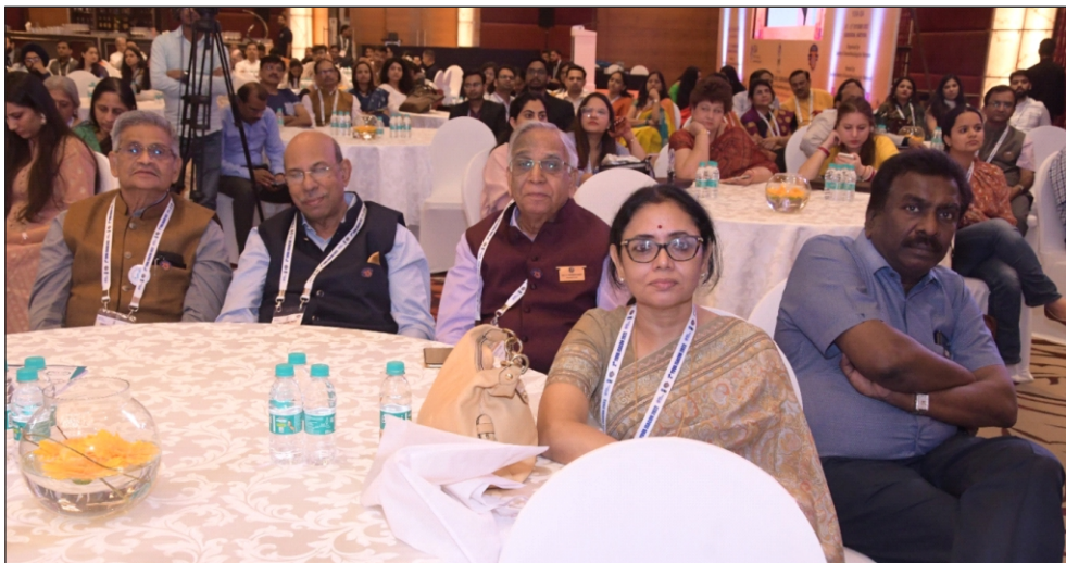
Inaugural Ceremony 2 nd National YUVA ISACON 2022, Haryana (14-15 October 2022)