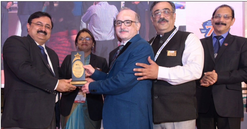
Felicitations Ceremony 2 nd National YUVA ISACON 2022, Haryana (14-15 October 2022)