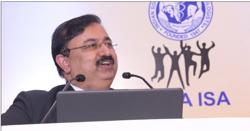
Inaugural Ceremony 2 nd National YUVA ISACON 2022, Haryana (14-15 October 2022)