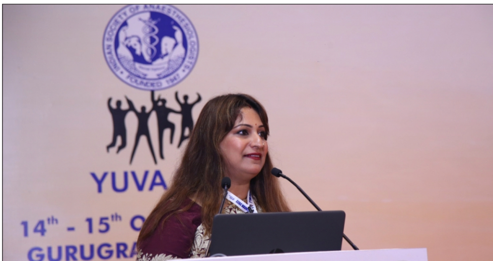
1 st Annual National YUVA Oration 2 nd National YUVA ISACON 2022, Haryana (14-15 October 2022)