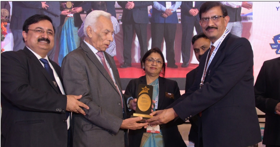
Felicitation Ceremony 2 nd National YUVA ISACON 2022, Haryana (14-15 October 2022)