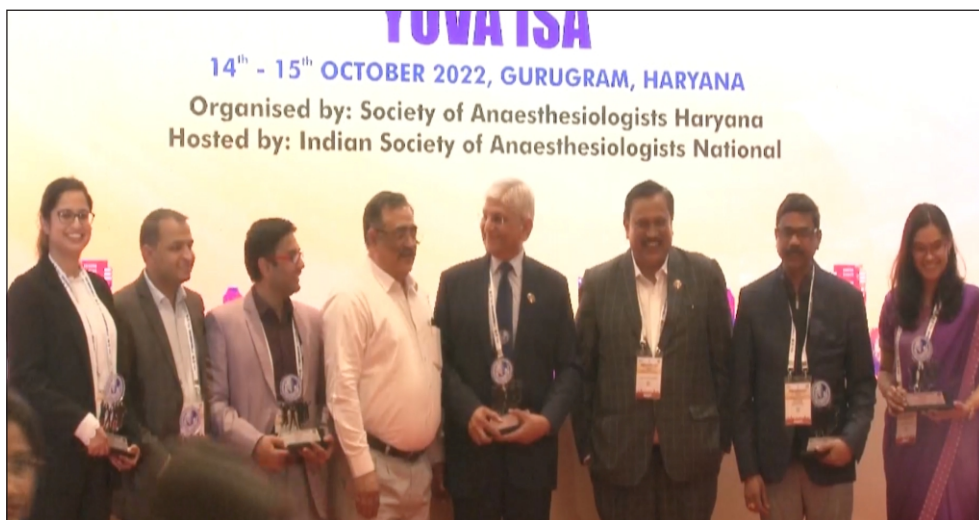
ISA Chandigarh State Branch Scientific Session 2 nd National YUVA ISACON 2022, Haryana (14-15 October 2022)