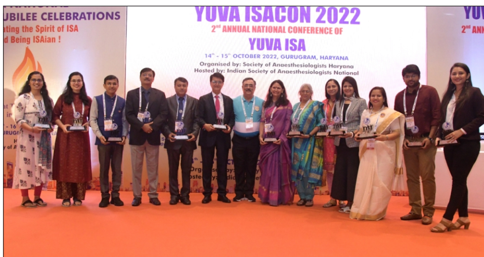
ISA Gujarat State Branch Scientific Session 2 nd National YUVA ISACON 2022, Haryana (14-15 October 2022)