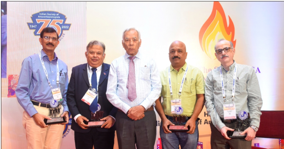
ISA Haryana State Branch Scientific Session 2 nd National YUVA ISACON 2022, Haryana (14-15 October 2022)