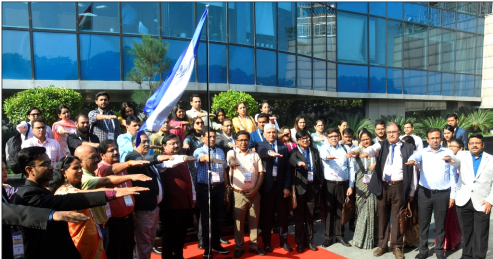
ISA Flag Hoisting during 2 nd National YUVA ISACON 2022, Haryana (14-15 October 2022)