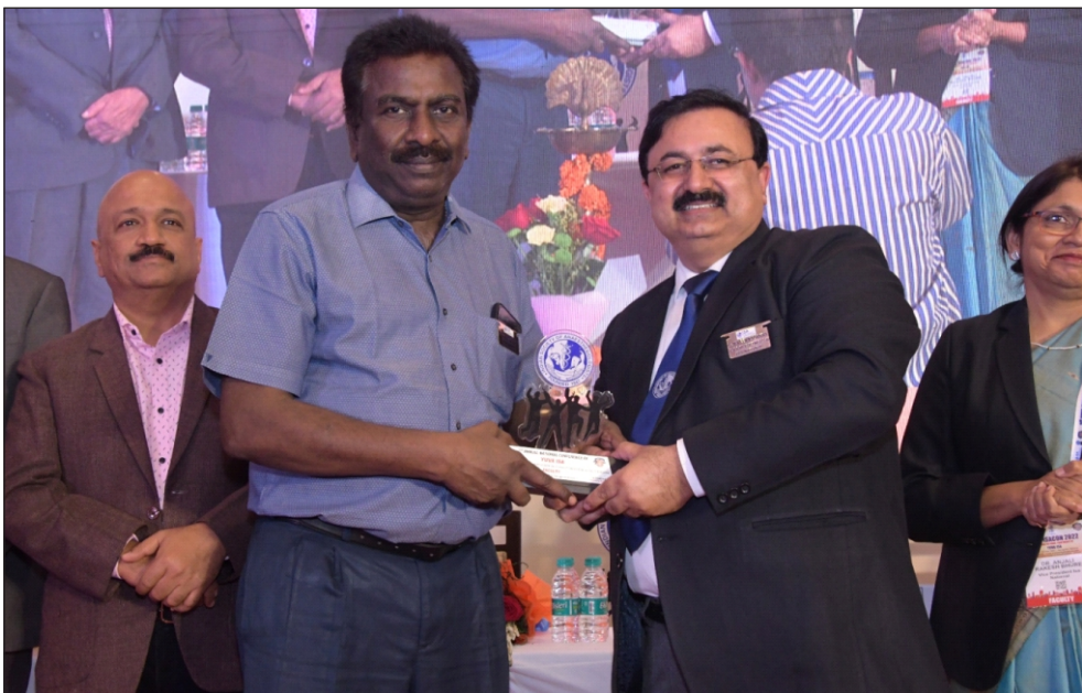
Felicitation of ISA National Governing Council Members 2 nd National YUVA ISACON 2022, Haryana (14-15 October 2022)