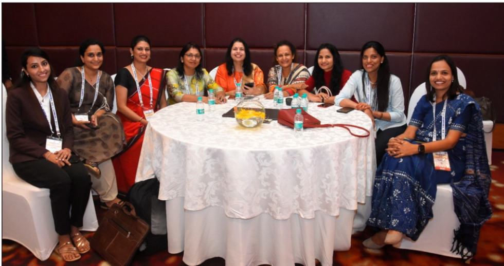
ISA Maharashtra State Branch Scientific Session 2 nd National YUVA ISACON 2022, Haryana (14-15 October 2022)