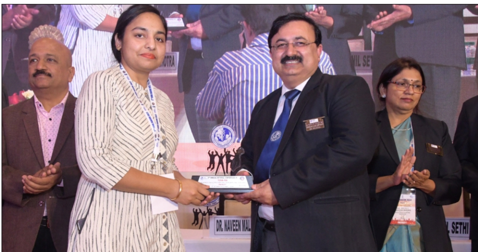
Felicitations of Organizing Committee 2 nd National YUVA ISACON 2022, Haryana (14-15 October 2022)