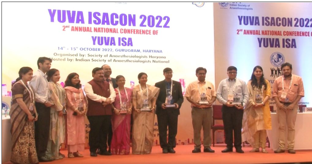
ISA Delhi State Branch Scientific Session 2 nd National YUVA ISACON 2022, Haryana (14-15 October 2022)