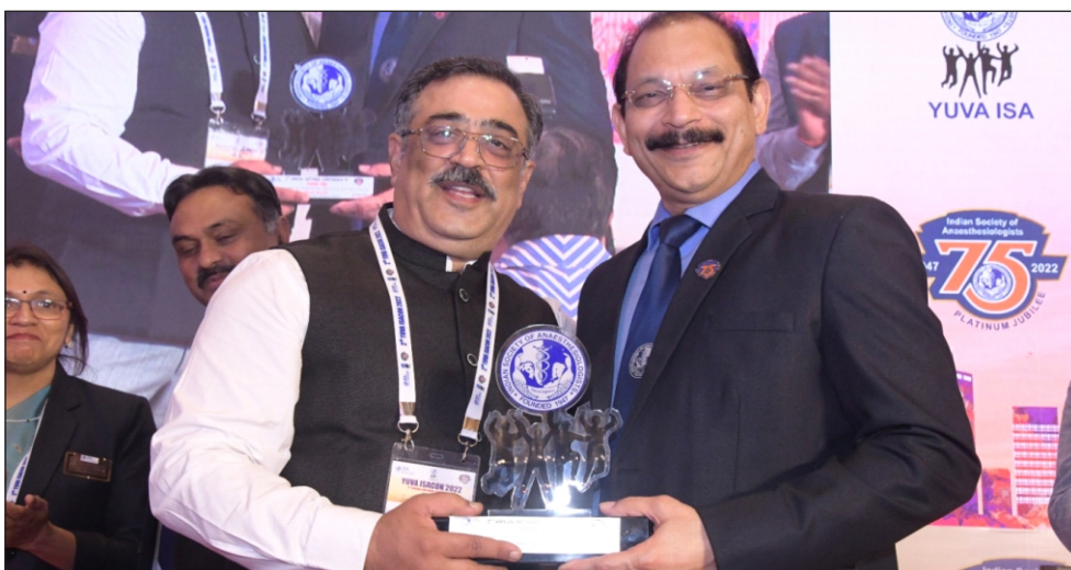
Felicitations of ISA National Governing Council Members 2 nd National YUVA ISACON 2022, Haryana (14-15 October 2022)