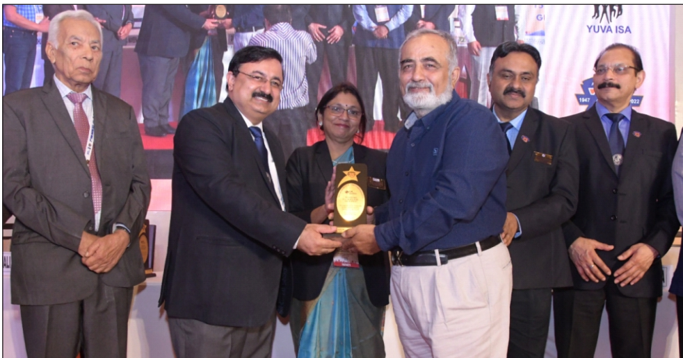
Felicitations Ceremony 2 nd National YUVA ISACON 2022, Haryana (14-15 October 2022)