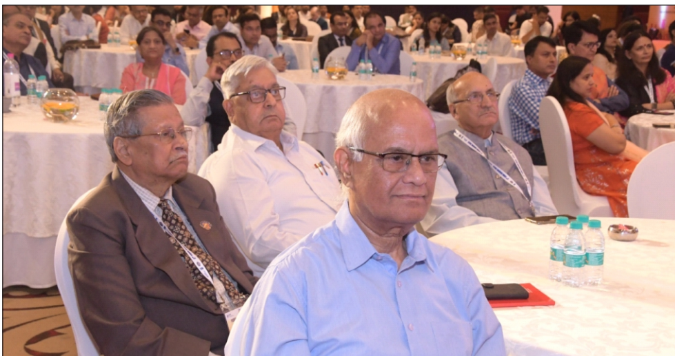
Inaugural Ceremony 2 nd National YUVA ISACON 2022, Haryana (14-15 October 2022)