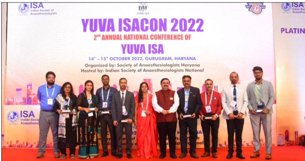
ISA Uttar Pradesh State Branch Scientific Session 2 nd National YUVA ISACON 2022, Haryana (14-15 October 2022)