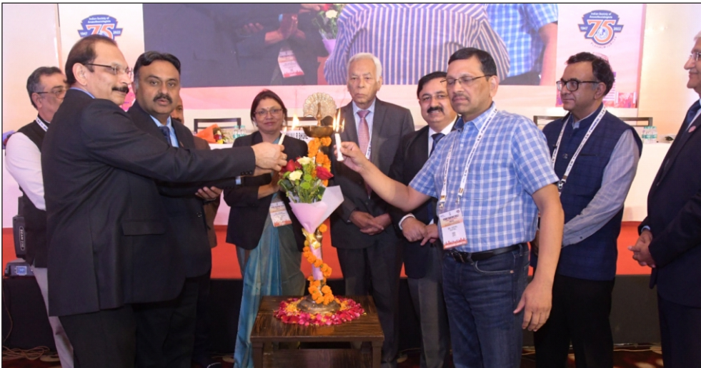
Inaugural Ceremony 2 nd National YUVA ISACON 2022, Haryana (14-15 October 2022)