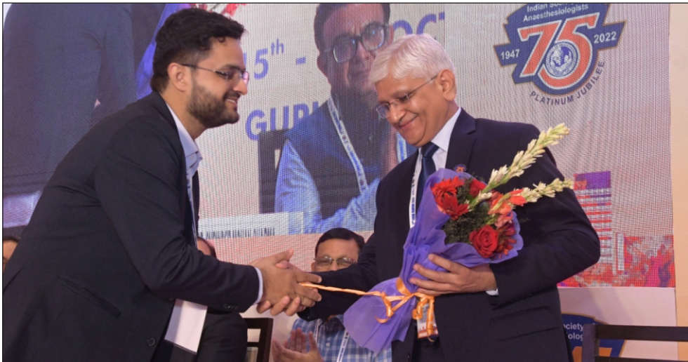
Inaugural Ceremony 2 nd National YUVA ISACON 2022, Haryana (14-15 October 2022)