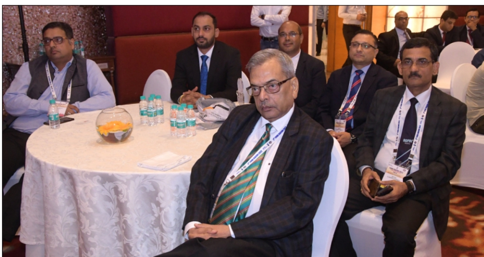
Inaugural Ceremony 2 nd National YUVA ISACON 2022, Haryana (14-15 October 2022)