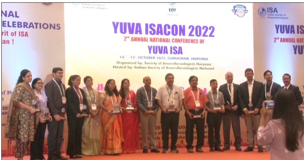
ISA Rajasthan State Branch Scientific Session 2 nd National YUVA ISACON 2022, Haryana (14-15 October 2022)